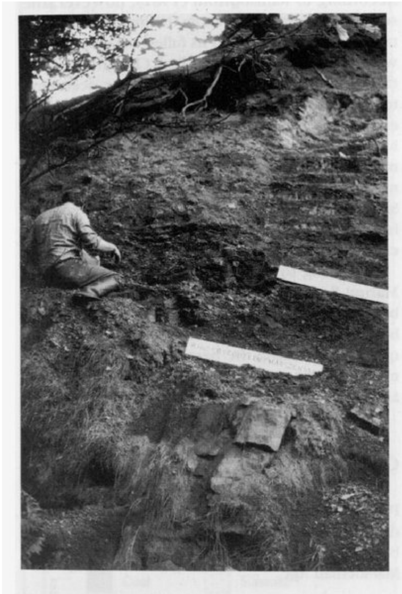
(Figure 2.6) Park Clough GCR site. International stratotype for the Kinderscoutian–Marsdenian stage boundary. Photographed during the visit to the site by the IUGS Subcommittee on Carboniferous Stratigraphy, August 1981.