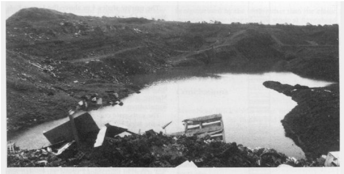
(Figure 10.17) Lower Langsetian lacustrine deposits exposed at Ravenhead Brickworks.