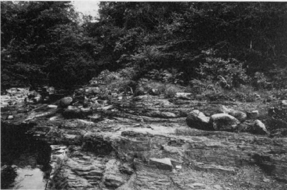
(Figure 4.15) Vale of Neath GCR site. Subcrenatum Marine Band.