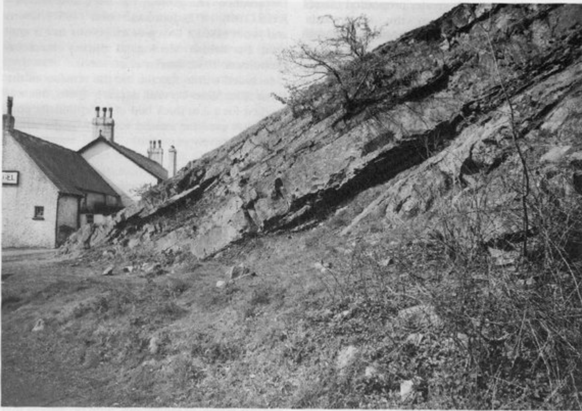
(Figure 4.14) Farewell Rock exposed behind Angel Inn, Vale of Neath GCR site. Reproduced by permission of the Director, British Geological Survey: NERC copyright reserved (A11957).