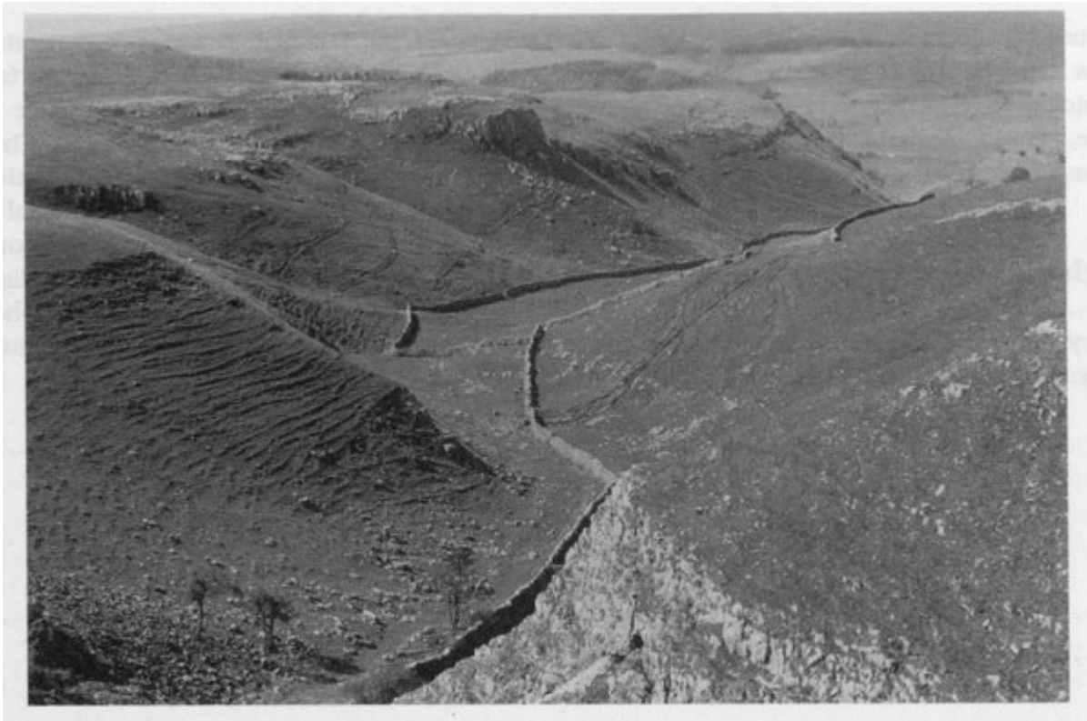
(Figure 2.50) The dry valley of Conistone Dib, seen from the limestone scars with Wharfedale in the distance.