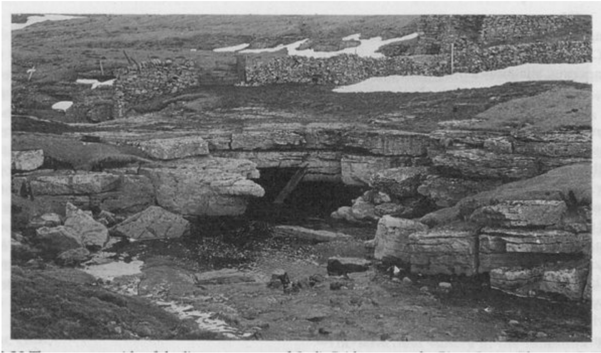
(Figure 3.22) The upstream side of the limestone span of God's Bridge across the River Greta.