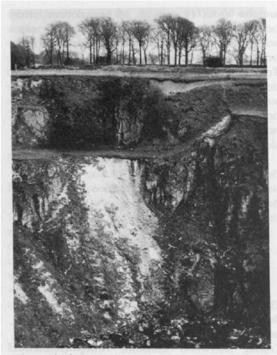
(Figure 4.14) Limestone walls and some remnants of the Pliocene sediment fill left after quarrying of the northwestern of the Green Lane Pits.