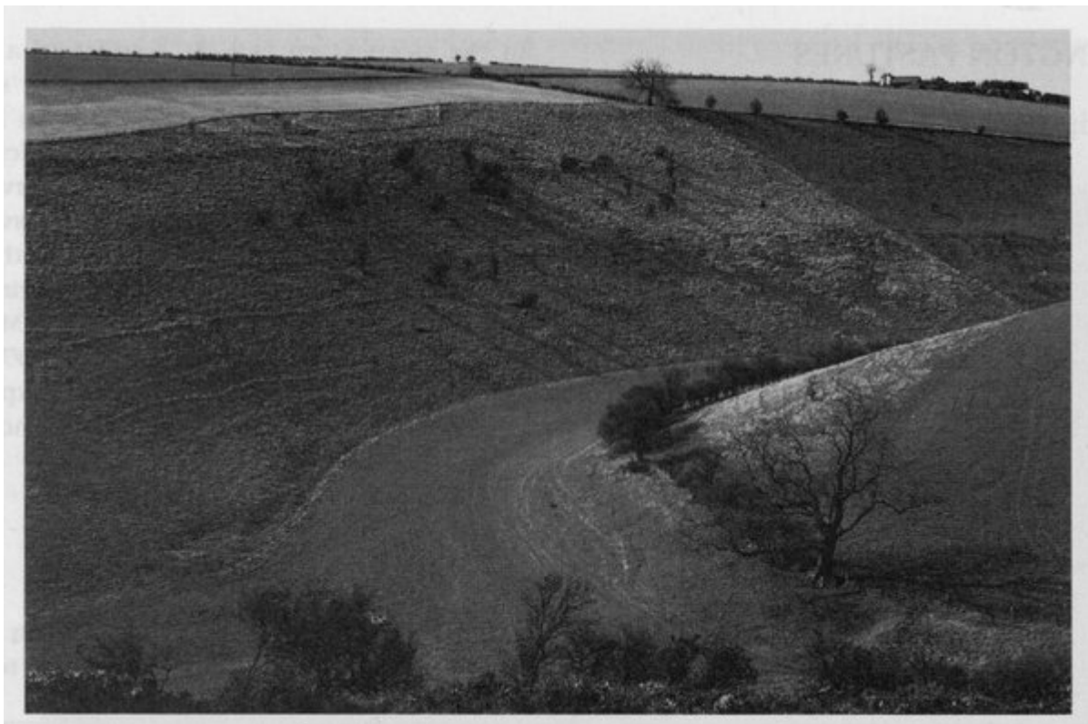
(Figure 7.15) One of the main dry valleys in the Millington Pastures system, with an almost flat floor of soliflucted head beneath slopes cut in weathered chalk.