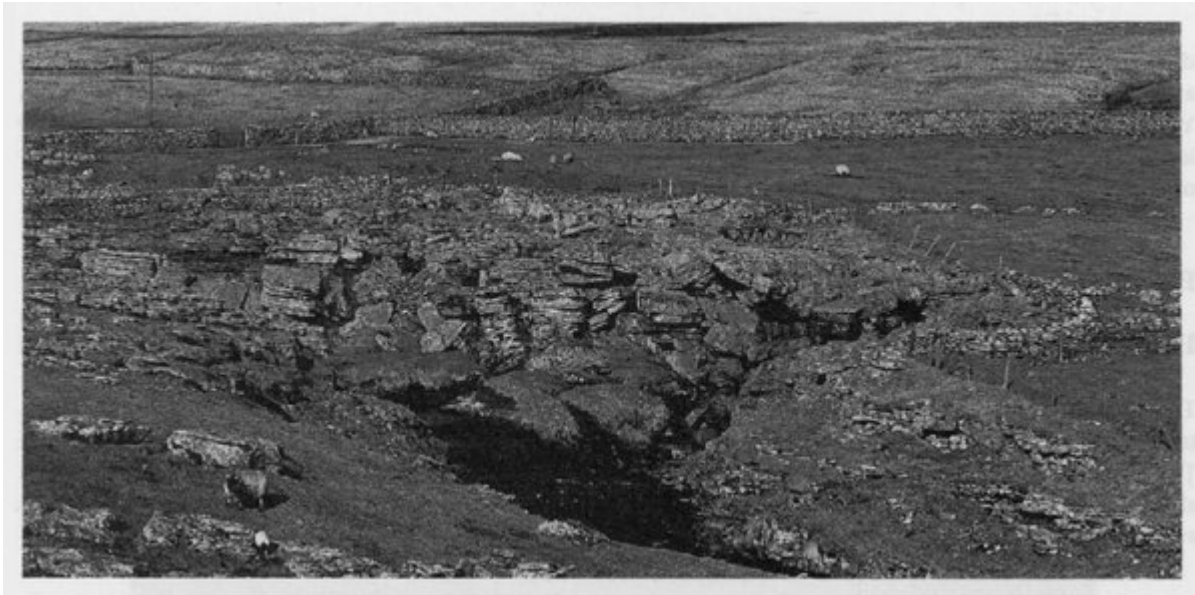
(Figure 2.41) The foundered blocks of limestone in the collapse area at Giant's Grave, Penyghent Gill.