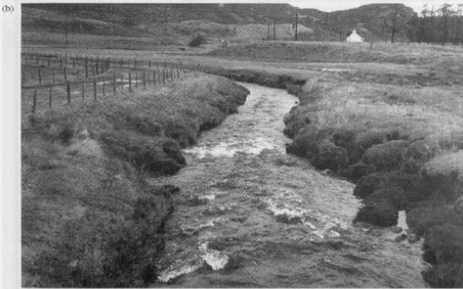
(Figure 2.38) Allt Mor (River Nairn). (a) The upper reach, boulder-bed mountain torrent, highly divided flow around unstable bars. (b) The lower reach, stable sinuous channel in Strath Nairn. The two reaches are only 2 km apart, illustrating the 'discordance' and rapid change in channel morphology.