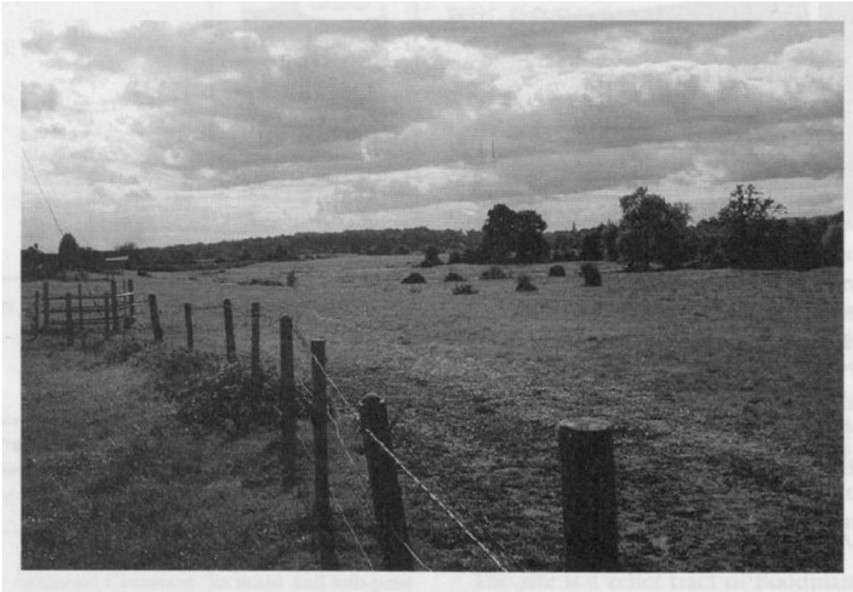
(Figure 6.28) General view of Ashmoor Common.