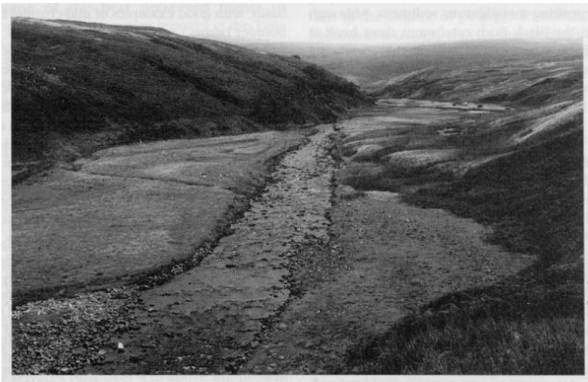
(Figure 5.4) Black Burn, looking upstream in a southerly direction, showing prominent meander cutoffs dated to between 1900 and 1957.