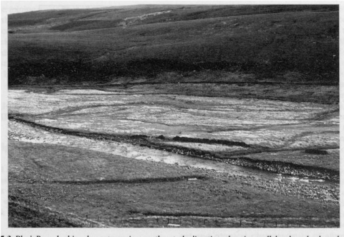
(Figure 5.3) Black Burn, looking downstream in a northeasterly direction, showing well-developed palaeochannels on low river terrace surfaces.