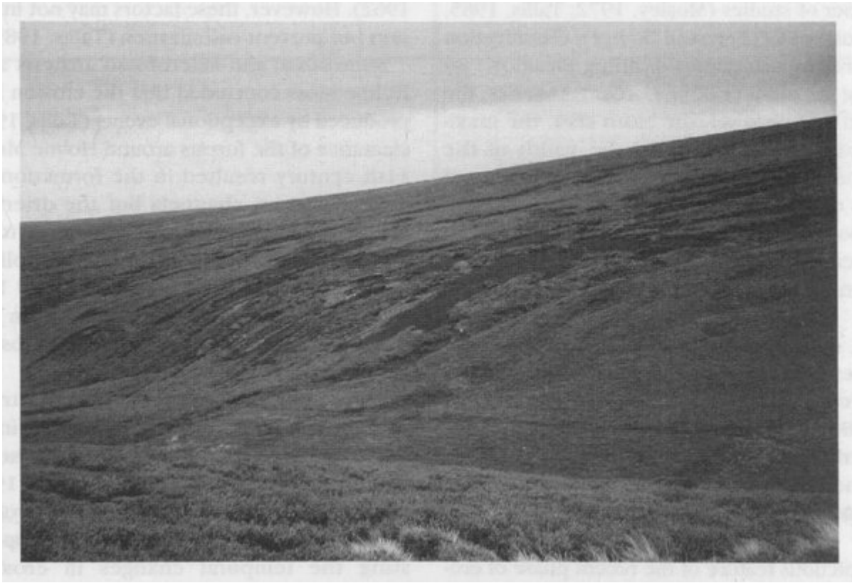
(Figure 6.31) Moorland areas undergoing peat erosion; Laund Clough, Bleaklow GCR site.