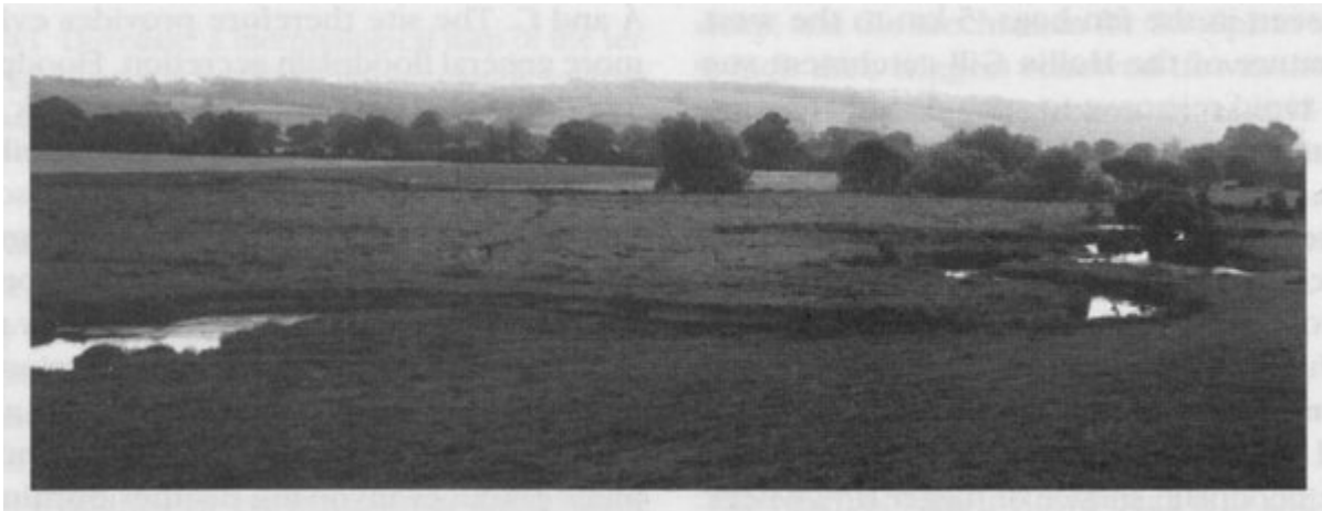
(Figure 6.43) Culm River and floodplain.