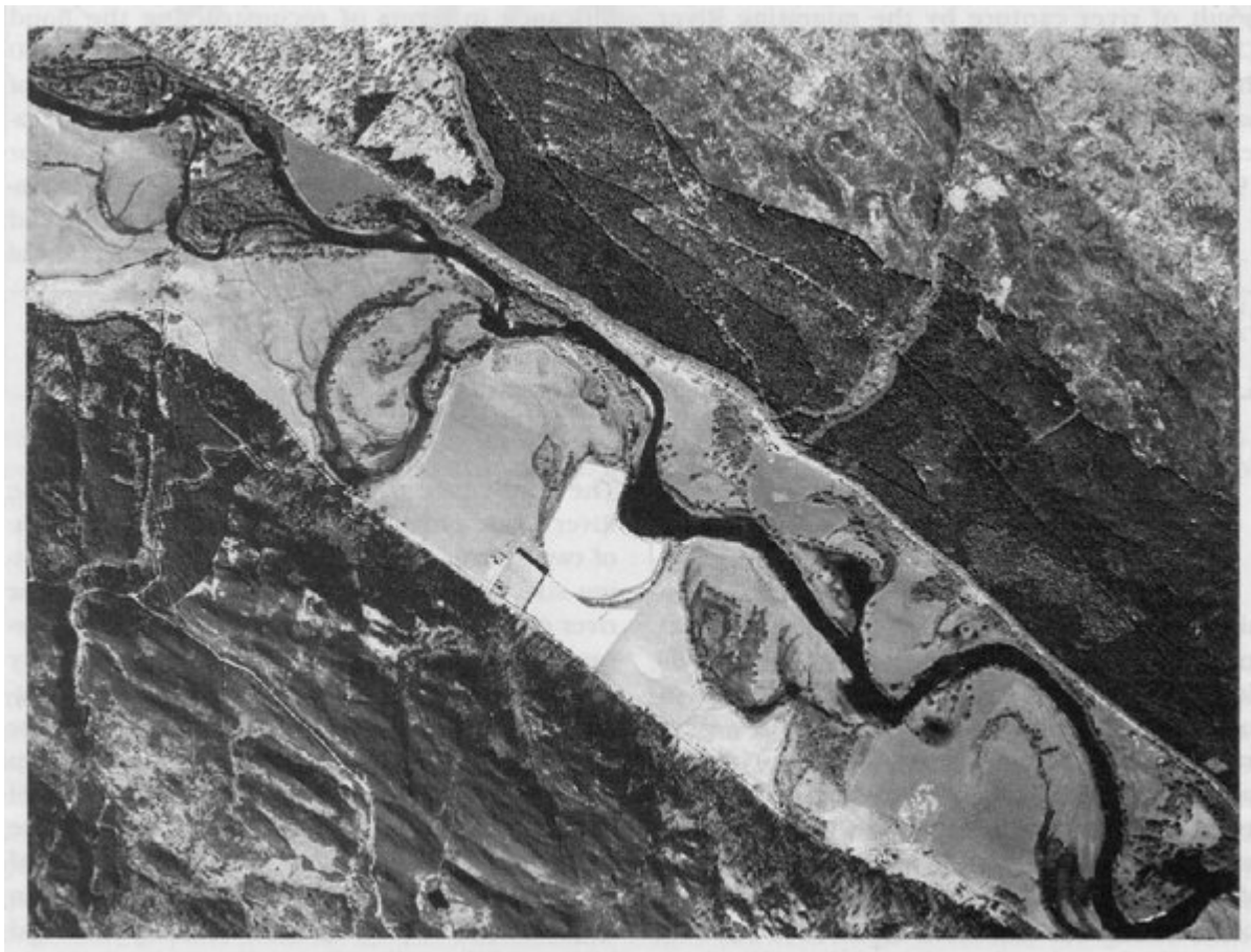
(Figure 2.13) Irregular meanders developed on the River Glass. The channel is characterized by a sequence of irregular meanders and associated slackwater areas plus numerous palaeochannels of contrasting ages embedded within the